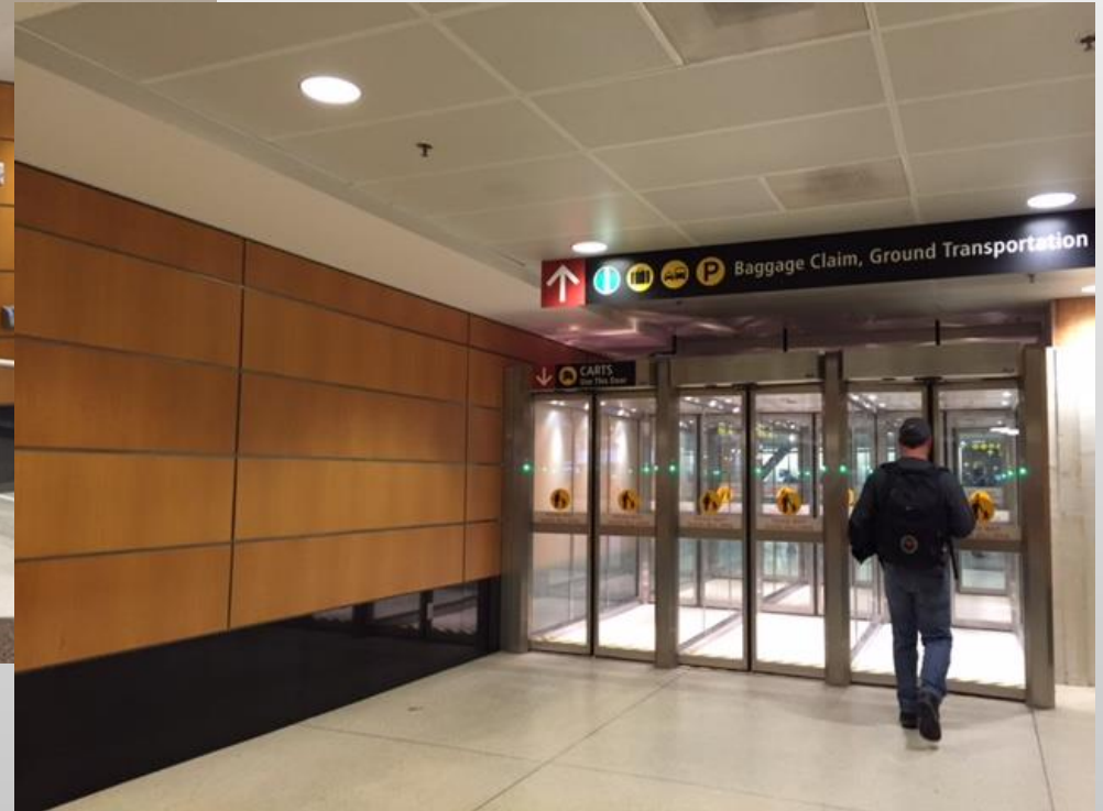
Exit Lanes installed at Concourse B